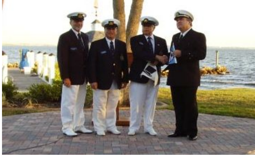
The old top hat is now hanging in the largest Yacht Club in Charlotte County Florida